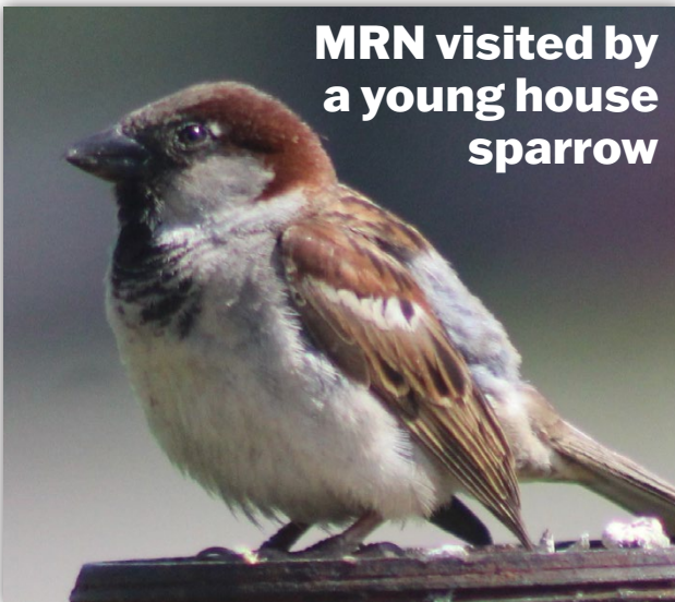
MRN visited by a young house sparrow This past week a young house sparrow came by the office of the Madrid Register-News. He chose to sit on a post and look at the building, deciding not to come in.