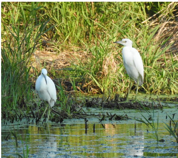
I found these two immature Little Blue Herons at Big Creek State Park on July 17. Numerous birders have seen them since. They are considered rare in Iowa and will be a deep blue when mature!

The city council will meet again on August 1 at 6 p.m. in the council chambers.